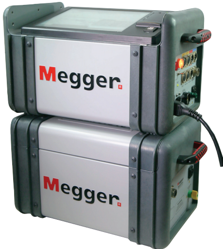
DELTA4310A test set shown above with onboard computer